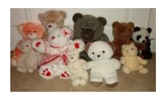
"TEDDY'S FOR TOTS"

Thanks everyone for helping at the watering stations - Holy Infant 2018 Shamrock Shuffle was another successful fun event.